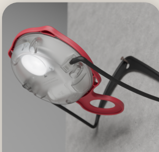
Versatile Flex-foot stand