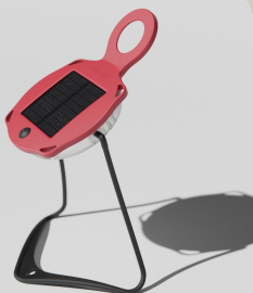
Integrated solar panel for ease of charge

* Solar charge at 1000 W/m 2 , 25 °C; Wall charger at 5W