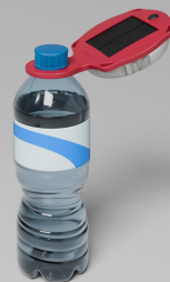
Round interface to use bottles as a stand